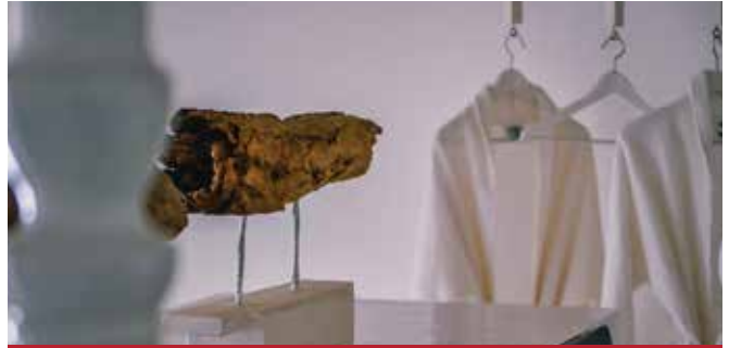
Superior Room (04 units)