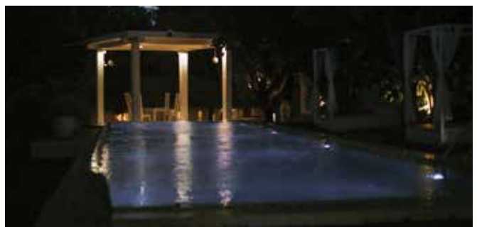
Night Time View